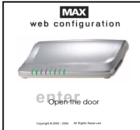
MAX 410/420/430 Splash Screen